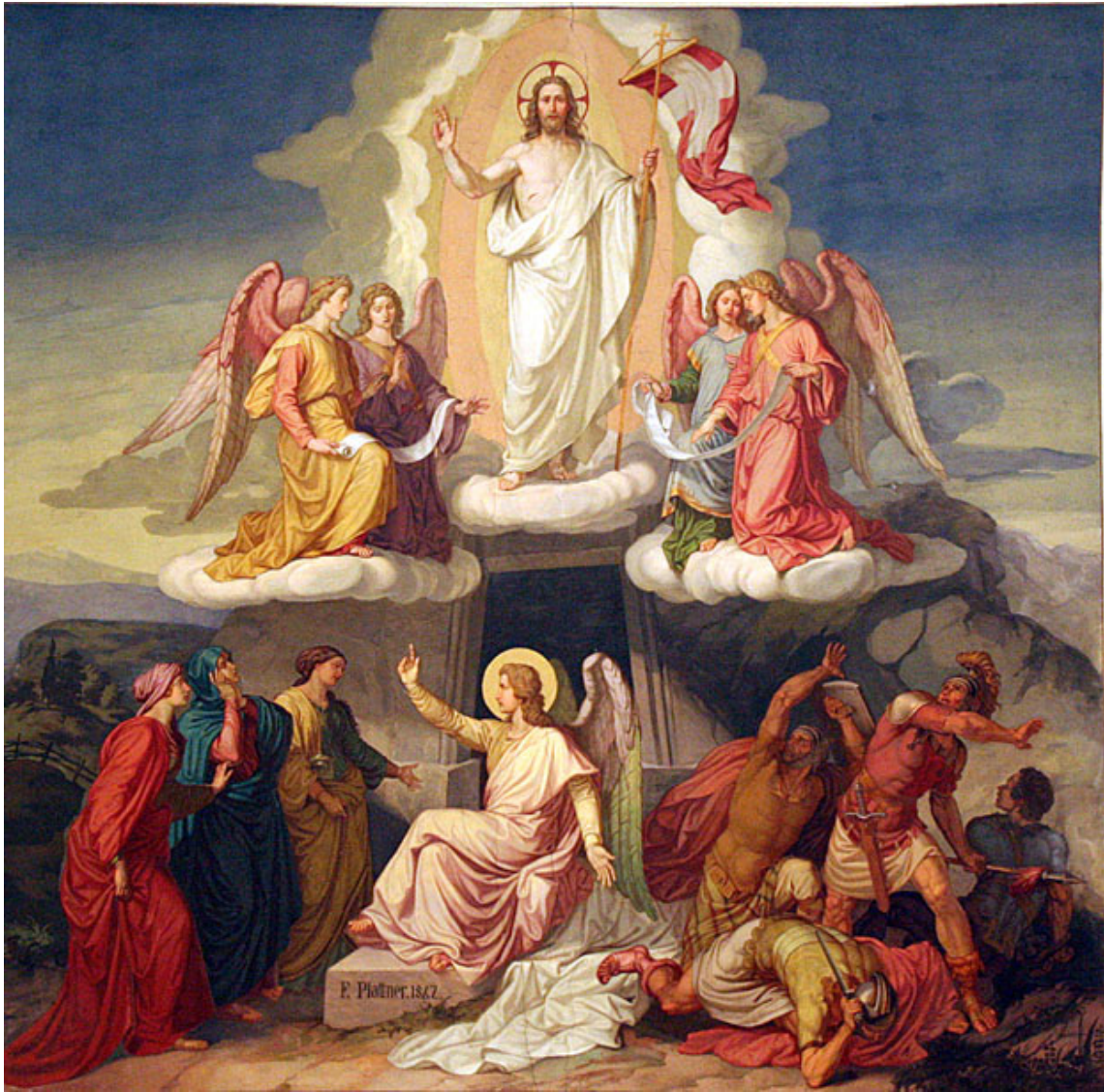
Resurrection of Christ, fresco in the vault of the Parish Church in Zirl, Austria.