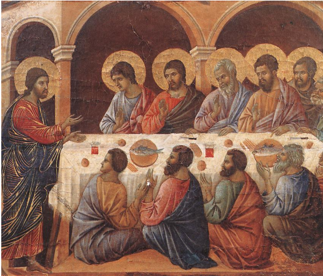
Appearance While the Apostles are at Table (ca. 1310), Duccio di Buoninsegna (1255–1319)