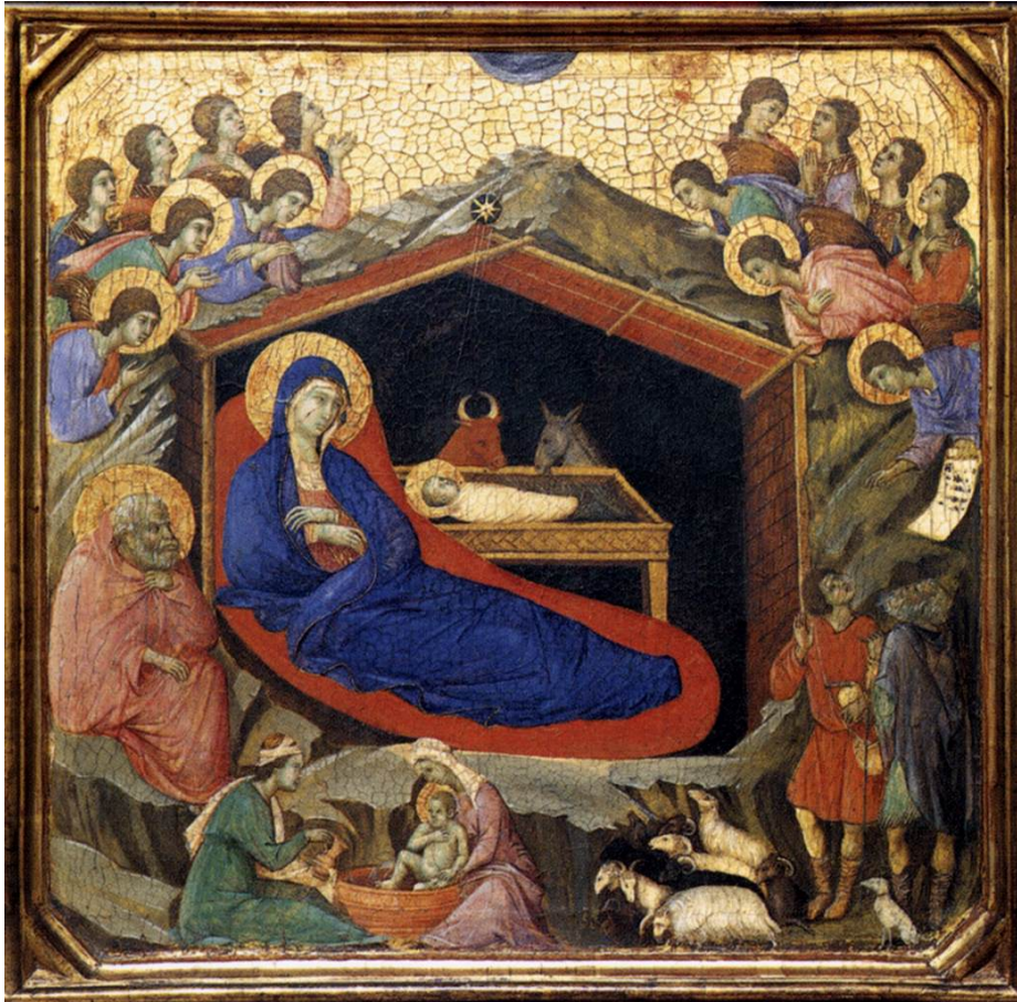
The Nativity with the Prophets Isaiah and Ezekiel , (1308-1311) Duccio di Buoninsegna (ca. 1250 - ca. 1319)