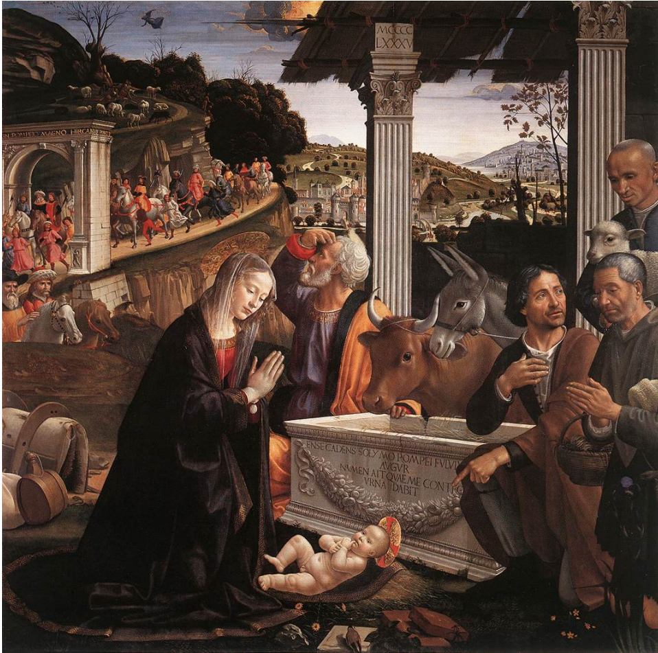
Nativity and Adoration of the Shepherds (altarpiece, 1485), Domenico Ghirlandaio (ca. 1448-1494)