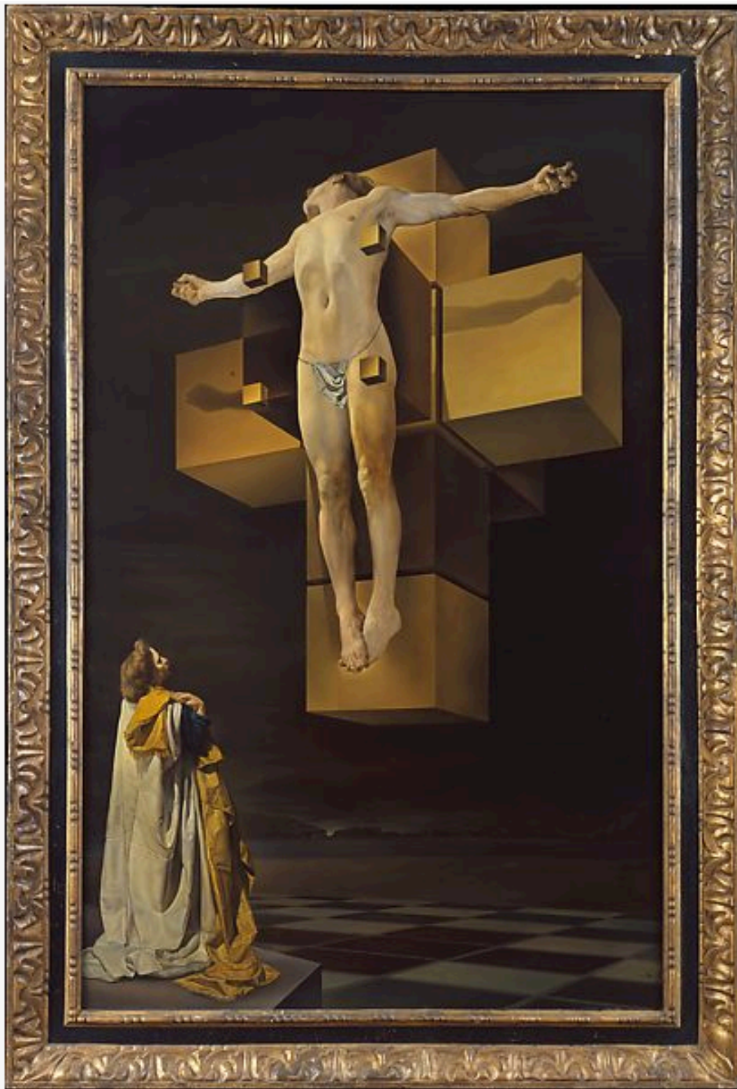
Crucifixion (Corpus Hypercubus) (1954), Salvador Dalí, Spanish

https://en.wikipedia.org/wiki/Crucifixion_(Corpus_Hypercubus)