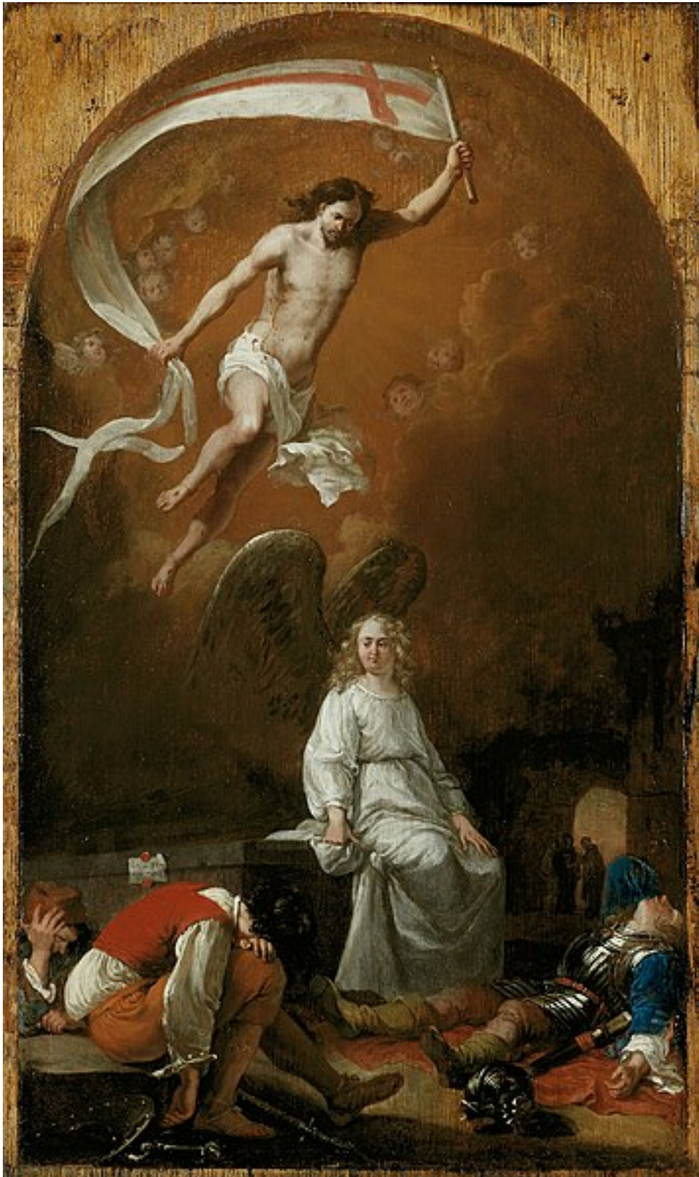
The Resurrection (1635), Bartholomeus Breenbergh (1598-1657), Dutch