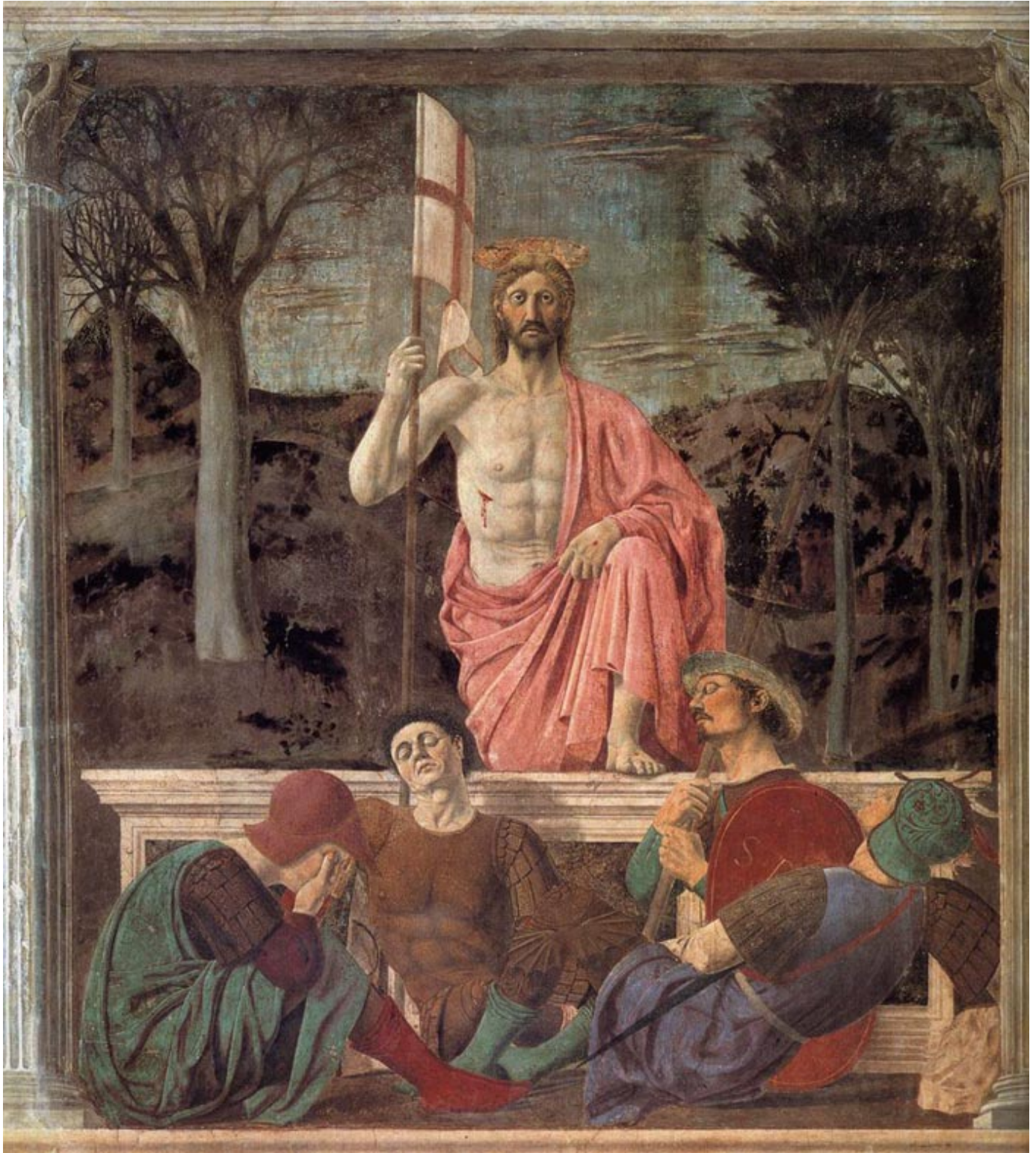
The Resurrection of Christ (1467-68), Piero della Francesca (ca. 1415-1492) From a fresco in the Meeting Hall of the Palazzo dei Conservatori di Sansepolcro, Italy

http://www.travelingintuscany.com/art/pierodellafrancesca/resurrection.htm