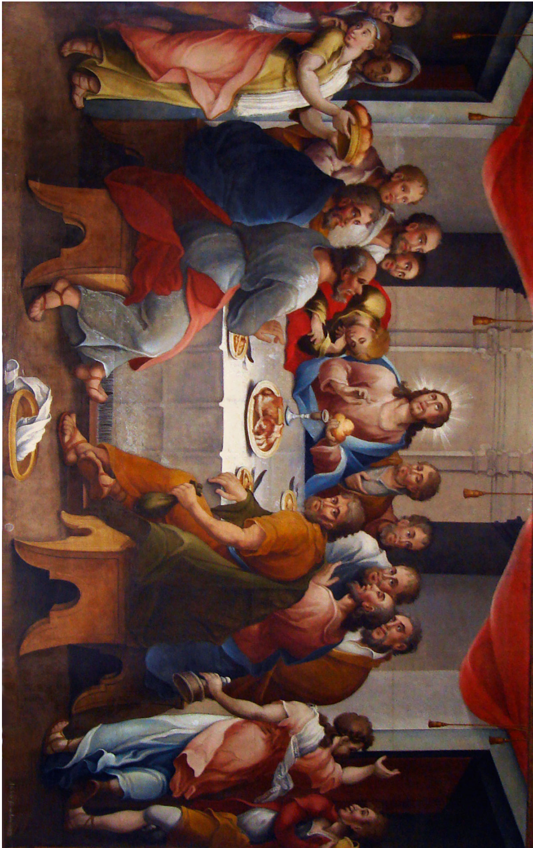
The Last Supper (1828), Manoel da Costa Ataíde (1762-1830)