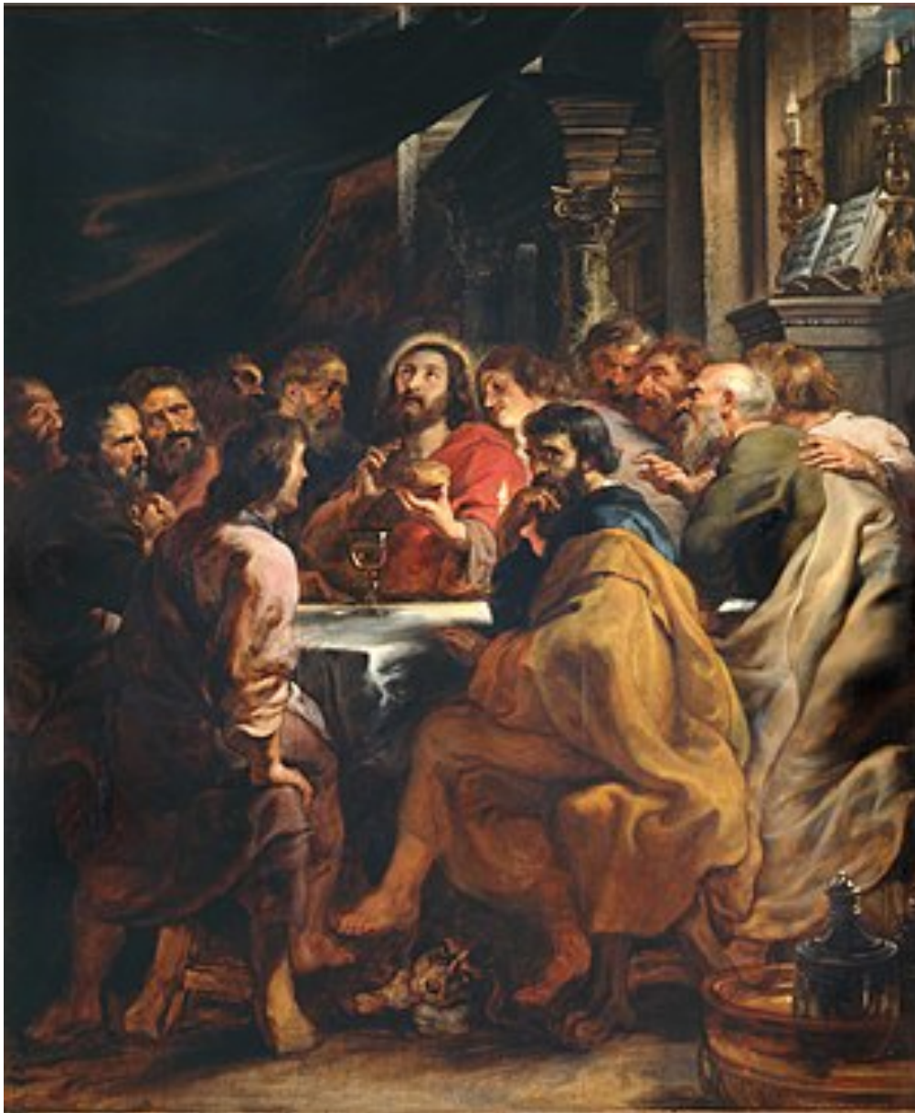
The Last Supper (ca. 1630), Peter Paul Rubens (1577-1640), Flemish

https://www.ranker.com/list/best-last-supper-paintings/ranker-art