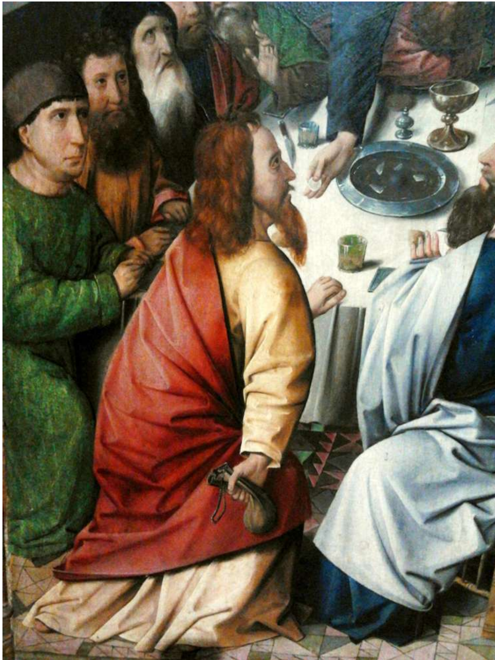
The Last Supper (1500), Colijn de Coter (ca. 1440 – ca. 1532)

https://www.ranker.com/list/best-last-supper-paintings/ranker-art