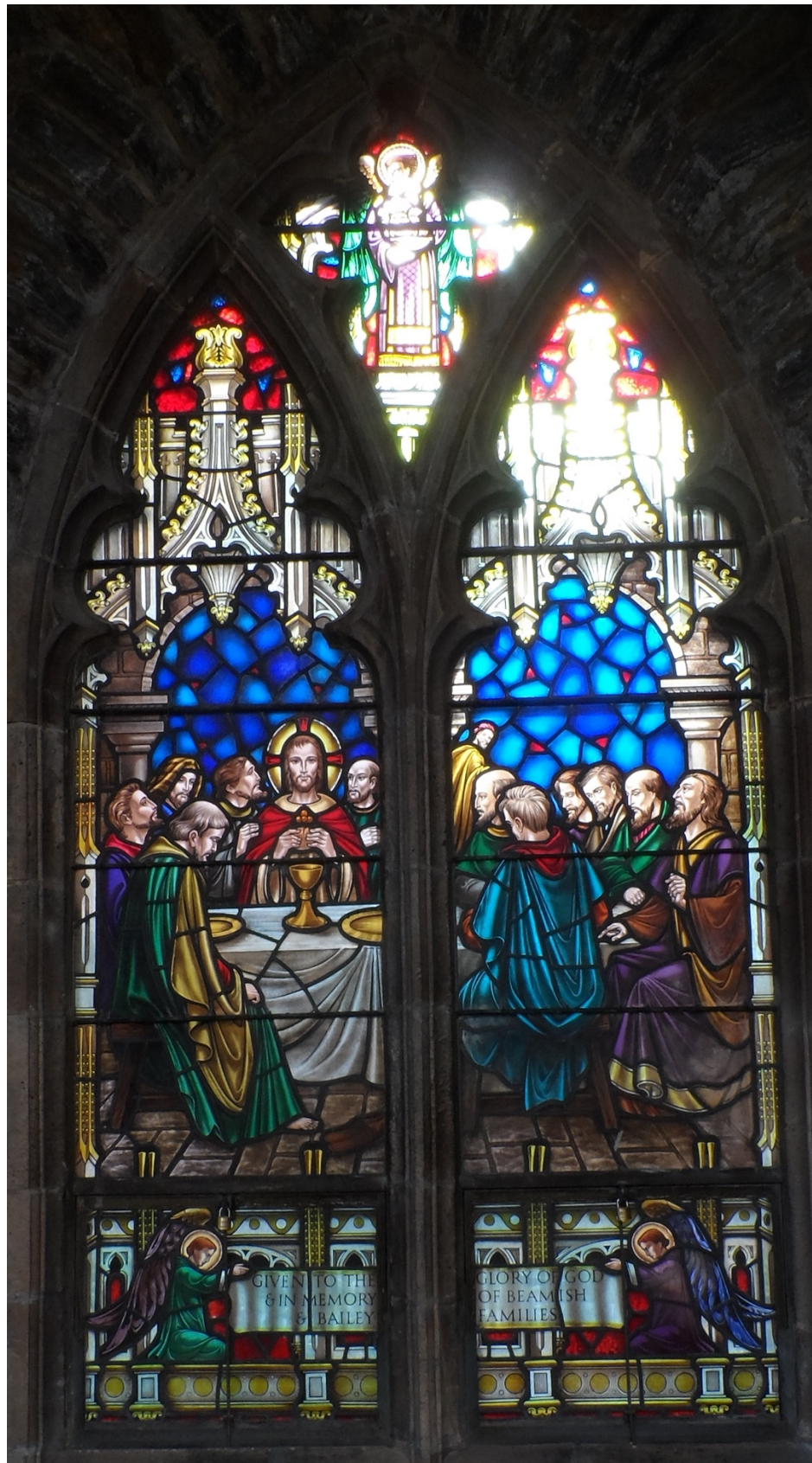
Institution of the Eucharist (ca. 1960), Stained glass window All Saints Episcopal Church, Woodhaven, New York